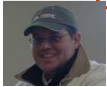
Building Relationships... One Handshake at a Time!

I want to take a moment and talk to you about part of my Oklahoma Community Institute Citizen's Academy class that I am enrolled in this year. For those of you who are not familiar with OCI, it is a community leadership program that challenges a person to become involved and do their part in making a difference in their own communities. The resources in this program are invaluable and attempt to get a person to see things from different perspectives and make decisions more quickly. One of the many things that struck a cord with me was the following poem, and I wanted to pass it along to you.